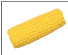
corn on the cob